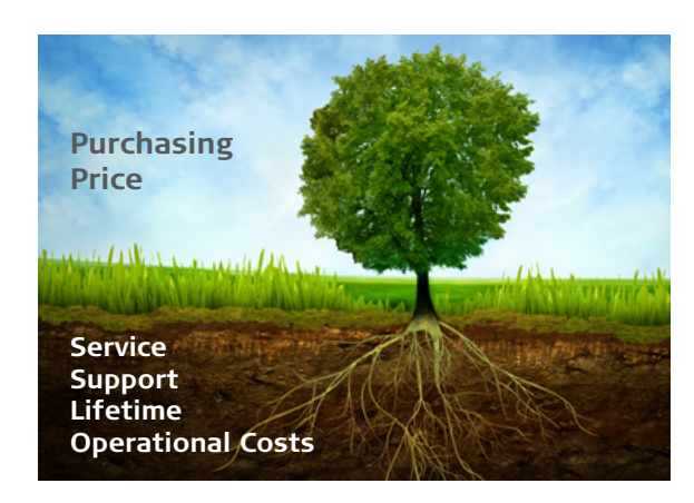
Figure 1 – When investing in a total station, the purchasing price is much more than what you see at first sight.

"We have a really good long-term experience with Leica Geosystems equipment. The service and technica support are beyond comparison."