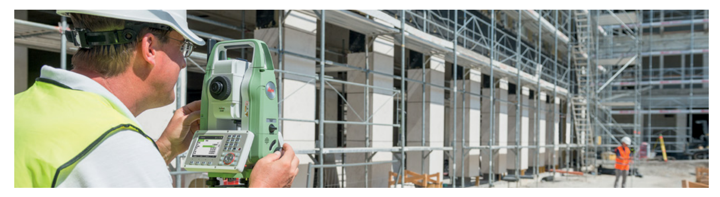
Figure 5 - Rely on a global network of certified local service partners and just focus on your work.

Leica Geosystems also offers Calibration Certificates Gold (for angle and distances) that are internationally acknowledged. The test results are directly traceable to national standards, include measurement uncertainties and are supplemented by detailed measurement reports. For Leica Geosystems within Switzerland this accreditation is in accordance with the standard ISO/IEC 17025 and is granted by the Swiss Accreditation Service (SAS), member of the International Laboratory Accreditation Cooperation (ILAC), a calibration laboratory that is accredited by the National Metrology Institute. This is unique for Leica Geosystems and cannot be offered by others.