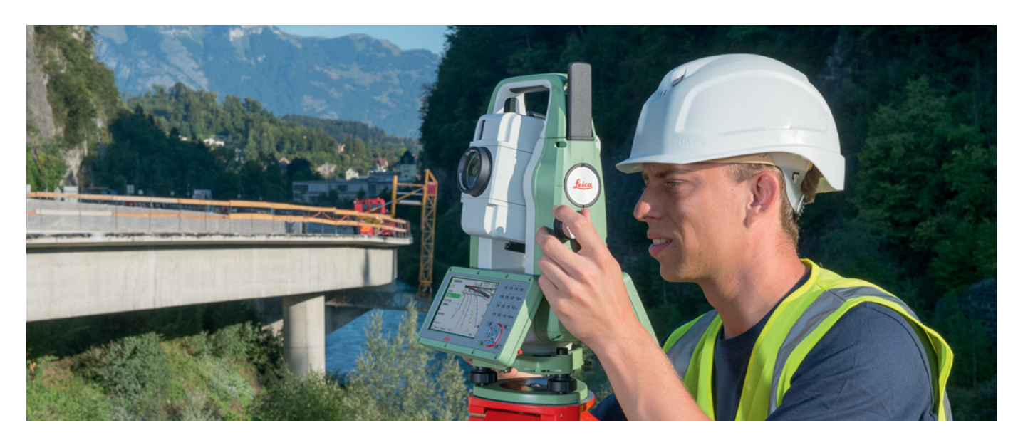
Figure 4 – The 4G modem enables you to make last-minute changes of design data in the field.

The new FlexLine total stations feature a 4G modem for mobile data connectivity . This enables the user to get remote access to cloud storage devices for data transfer from field to office and vice versa (Leica Exchange or having remote access in case of support requirements with Leica Active Assist). Last-minute changes of design data can easily be transferred into the field via the cloud. No need to drive back to the office or even redo layout work due to using outdated data. An increased productivity will increase your income, substantiating your decision to purchase a higher-value total station.