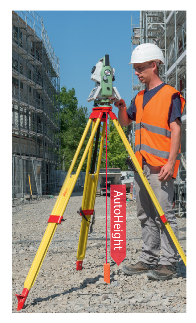
Figure 3 – Get your instrument height by simply pressing a button with the AutoHeight feature.

The endless drives (horizontal on the right and vertical on the left side of the instrument) contribute significantly to the increased productivity. The drives allow to coarse and fine aim without the need to clamp anything. Furthermore, the FlexLine instruments feature a trigger key on the side of the instrument, which enables the operator to execute measurements. The fast and precise pinpoint distance measurement system contributes significantly to the speed of the total station. Targets can be easily measured even under difficult weather conditions (rain, sun, cold, heat, etc.).